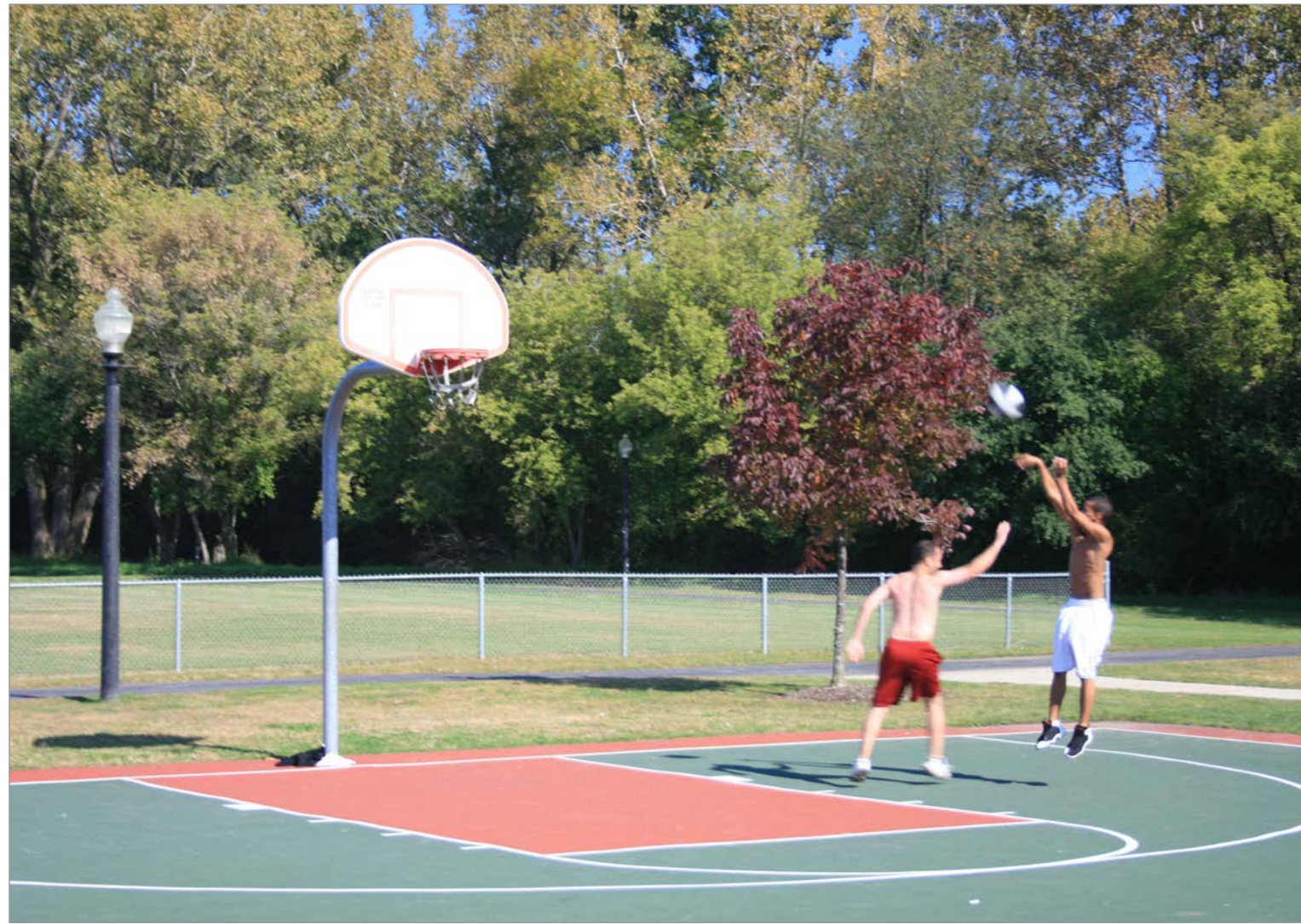
Basketball court renovations