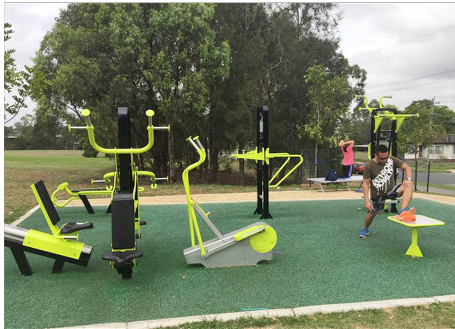
Outdoor fitness stations