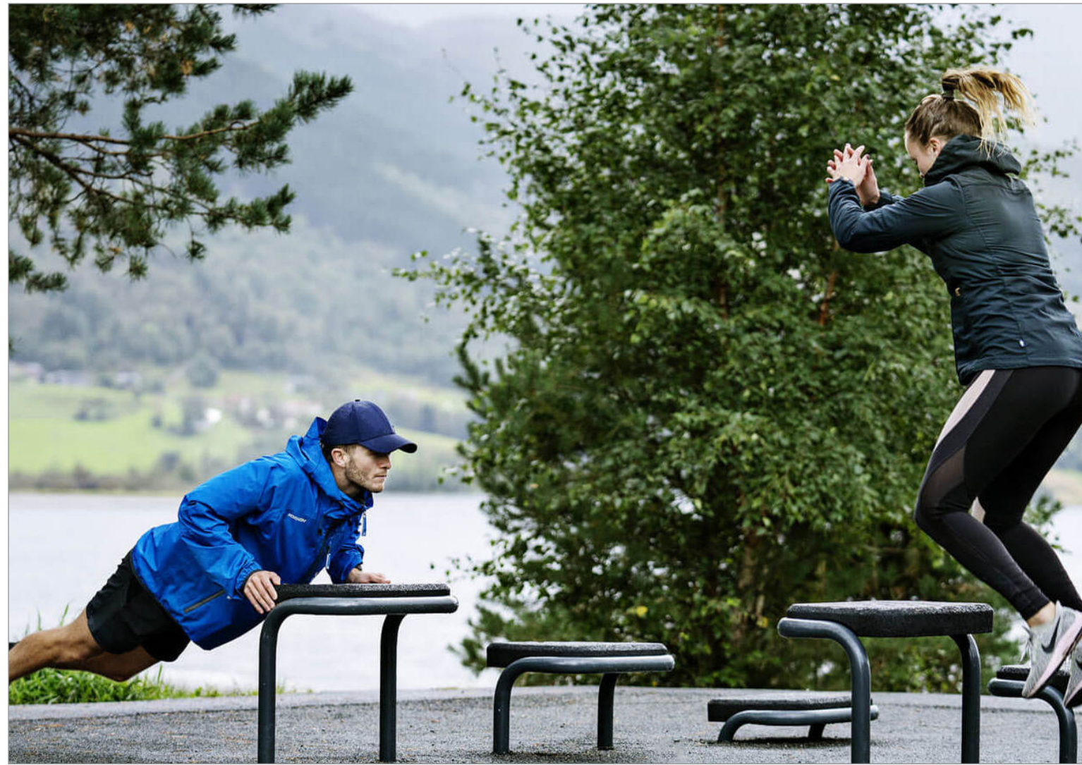
Outdoor fitness stations